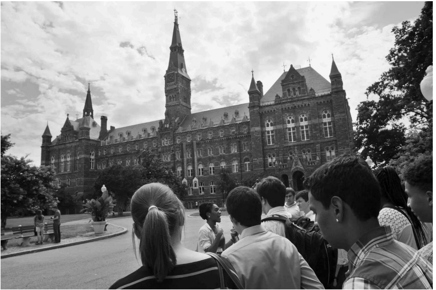
Prospective students tour Georgetown University's campus in Washington, July 10, 2013.